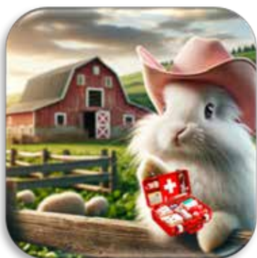
Fluffy has a small. Bunny Kit

From that day forward, the animals of the ranch took Kai's teachings to heart. They each assembled their first aid kits, knowing that being prepared for emergencies was not just a responsibility but a testament to the strength of their community. And so, under the watchful eyes of Kai the Ranch Coyote, the Ranch became a safer and more resilient place for all its inhabitants.