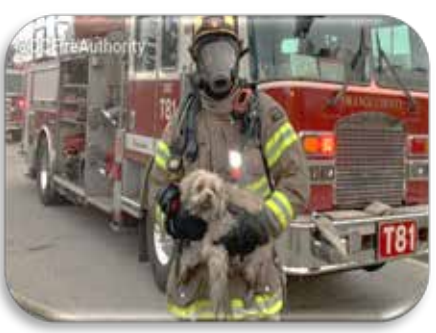
A dog was rescued by firefighters in Orange County