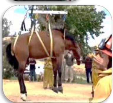
Los Angeles County firefighters rescued a horse

SUPPORT YOUR FIRE DEPARTMENT – THEY SAVE LIVES – All lives!